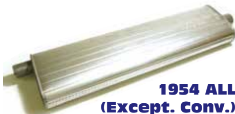
1954 ALL (Except. Conv.)