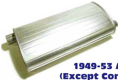
1949-53 ALL (Except Conv.)